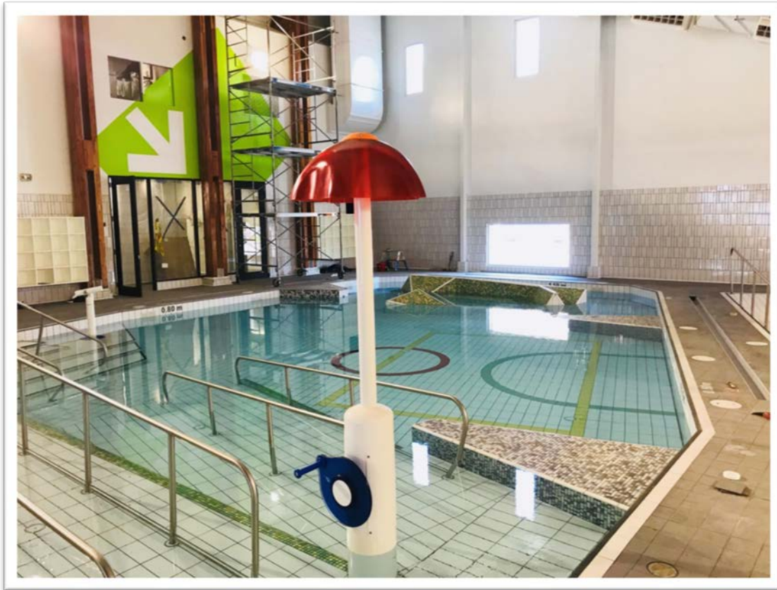
Caption: The new Leisure Pool with interactive water features is now complete and awaits commissioning.