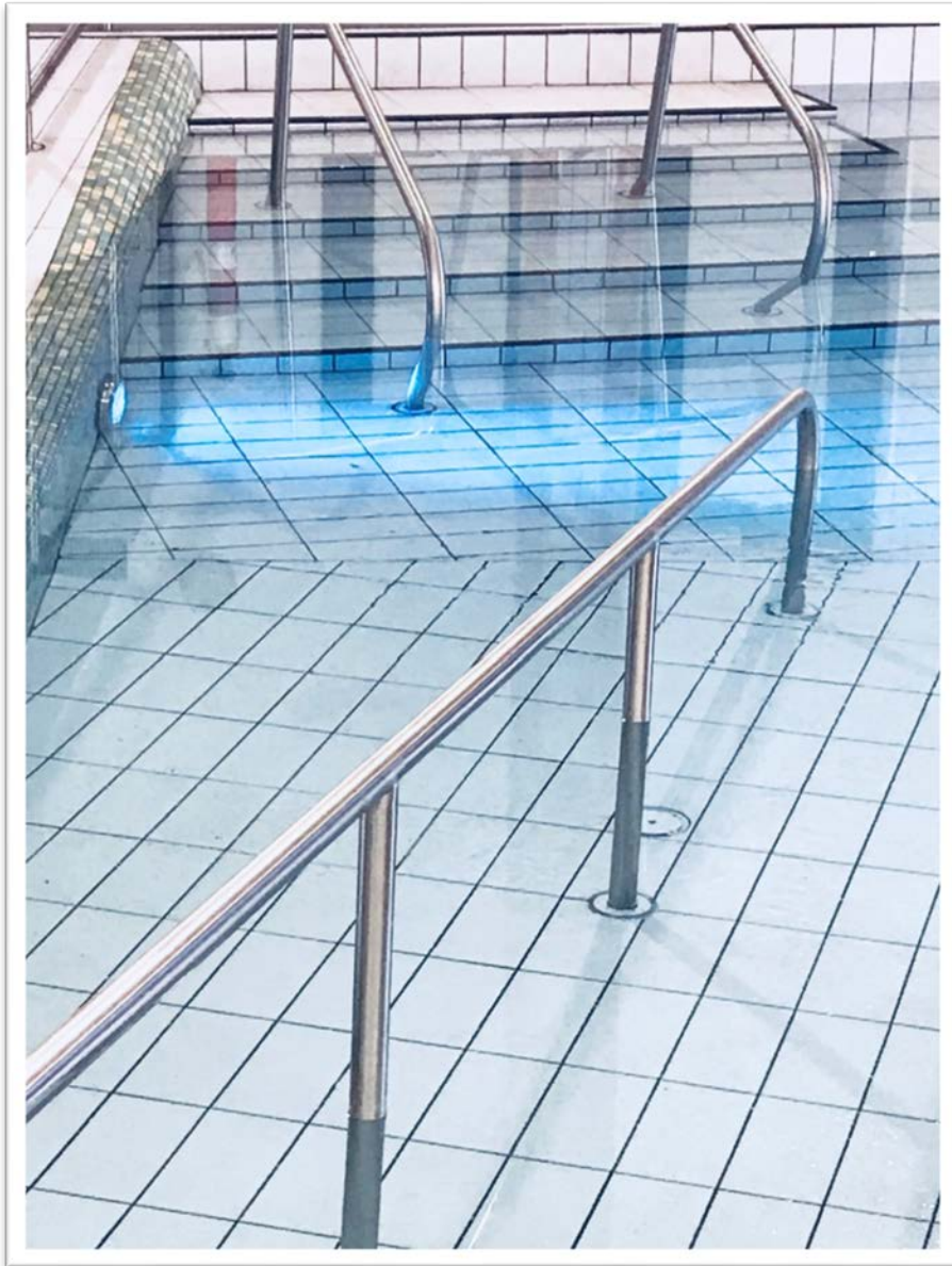
Caption: New colorful lights are now operating throughout the facility. The lights change color and are installed in the Leisure Pool, the Hot Tub as well as the Lap Pool.