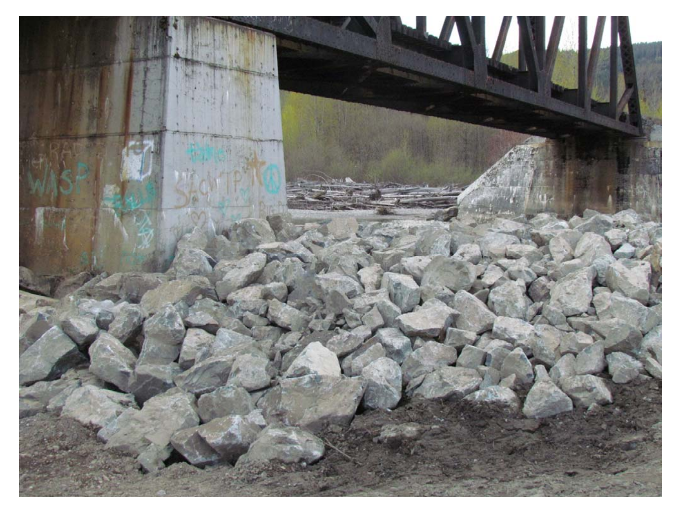
Mitigation Work at Fisherman's Memorial Park

The Rotary Club donated materials and labour to upgrade the Howe Creek trail system. A one day work-bee had over 30 volunteers participate in the project. Mitigation work was done at the Fisherman's Memorial Park to repair the high water damage done in 2011. A study of the boat launch site will be done in 2013. The George Little Park sign was installed in 2012. The sign is a notable piece of public art. The George Little Park received 3 more exposed aggregate concrete picnic tables creating a more welcoming space for park users. Ferry Island campground added 12 electrical serviced sites and two pit toilets to its southern loop. Future plans will add another 12 electrical serviced sites to this area. Four of the Kin Park horse shoe pits were rebuilt in 2012 with the assistance of volunteers and business donations. The parking lot at Ferry Island adjacent to Highway 16 West received cold asphalt placement last year. Local fishermen and trail users of Ferry Island were appreciative of this upgrade. The City purchased a 2012 tractor for the parks department.