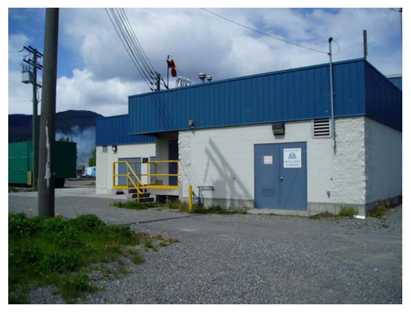
Frank Street Well

The Public Works Department is responsible for operation of the City's infrastructure as well as the construction of most capital works improvement projects. The areas of responsibility include: roadway maintenance and reconstruction, snow and ice control, engineering and construction, storm water drainage collection, sanitary sewage collection and treatment, potable water supply and distribution, solid waste collection, composting, purchasing, city buildings and municipal fleet vehicles.