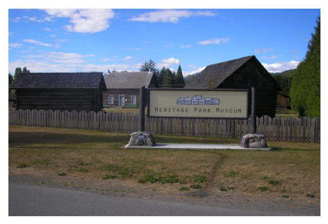
Heritage Park Museum