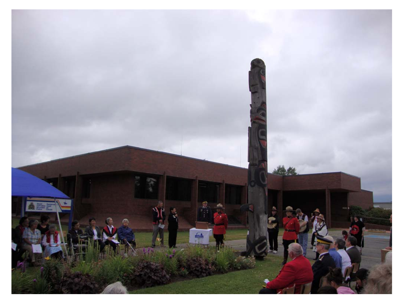
Celebration of the 25<sup>th</sup> Anniversary of the Kitsumkalum Totem Pole at the RCMP detachment