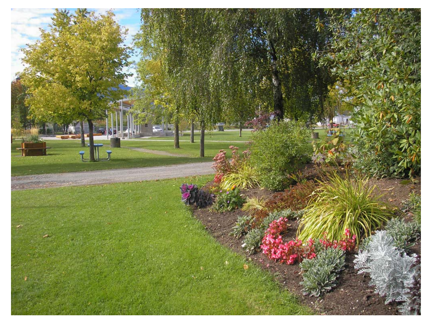
Terrace Public Library Garden