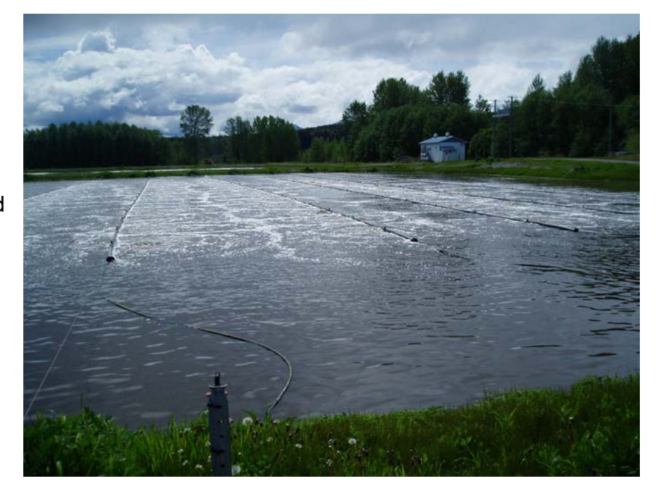
Sewage Treatment Lagoons

• At the Sewer Treatment Plant, A new variable frequency drive and programmable control was installed at the Wastewater Treatment Plant (WWTP).