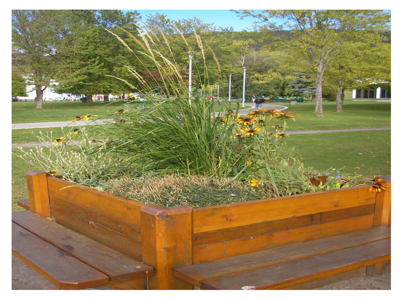
Fitness Centre at George Little Park

The City received a grant from the UBCM Age Friendly Community Planning and Projects program to increase sport and fitness opportunities for senior aged persons in Terrace and its surrounding area. The City has been working with the local clubs and organizations to create a brochure highlighting Silver Sneakers Sports and Fitness Activities for Persons 50 + Years . The program will continue with more opportunities in 2013. The City received a grant to assist in the production of Celebrate Canada events and activities. Some funds were used by the City to organize events in the George Little Park and some funds were dispersed to local organizations such as the Terrace and District Arts Council and Kermode Friendship Centre to assist them in hosting community events. Program highlights included Senior's Appreciation Month at the pool, Circus week and Speed Control Rock camp. Friday Teen Swims were cancelled and replaced with Free Friday Public Swims. The George Little Park continues to be an attractive location to host community events during the summer months. The number of markets and festivals being held in the park has increased significantly since 2009.