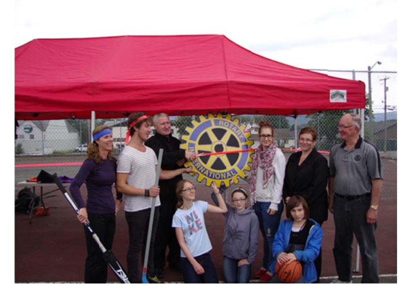
Ball Hockey Court Grand Opening