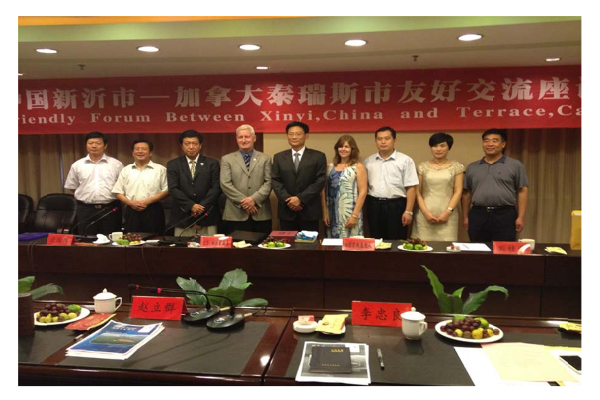
Mayor's Trip to China 2012