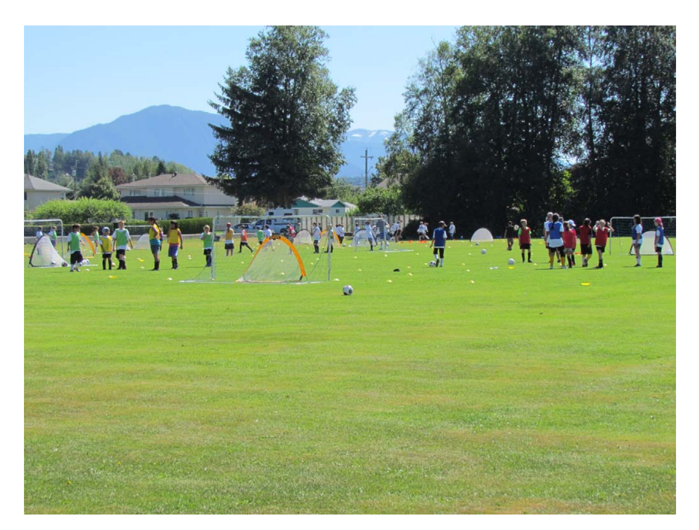
Kids' 2012 Youth Soccer Camp