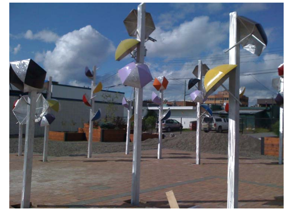
Mayor and Councillor attended a Regional District of Kitimat-Stikine board meeting (November) Councillor