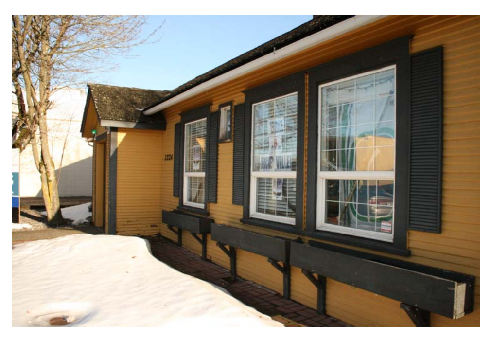
Terrace Economic Development Authority