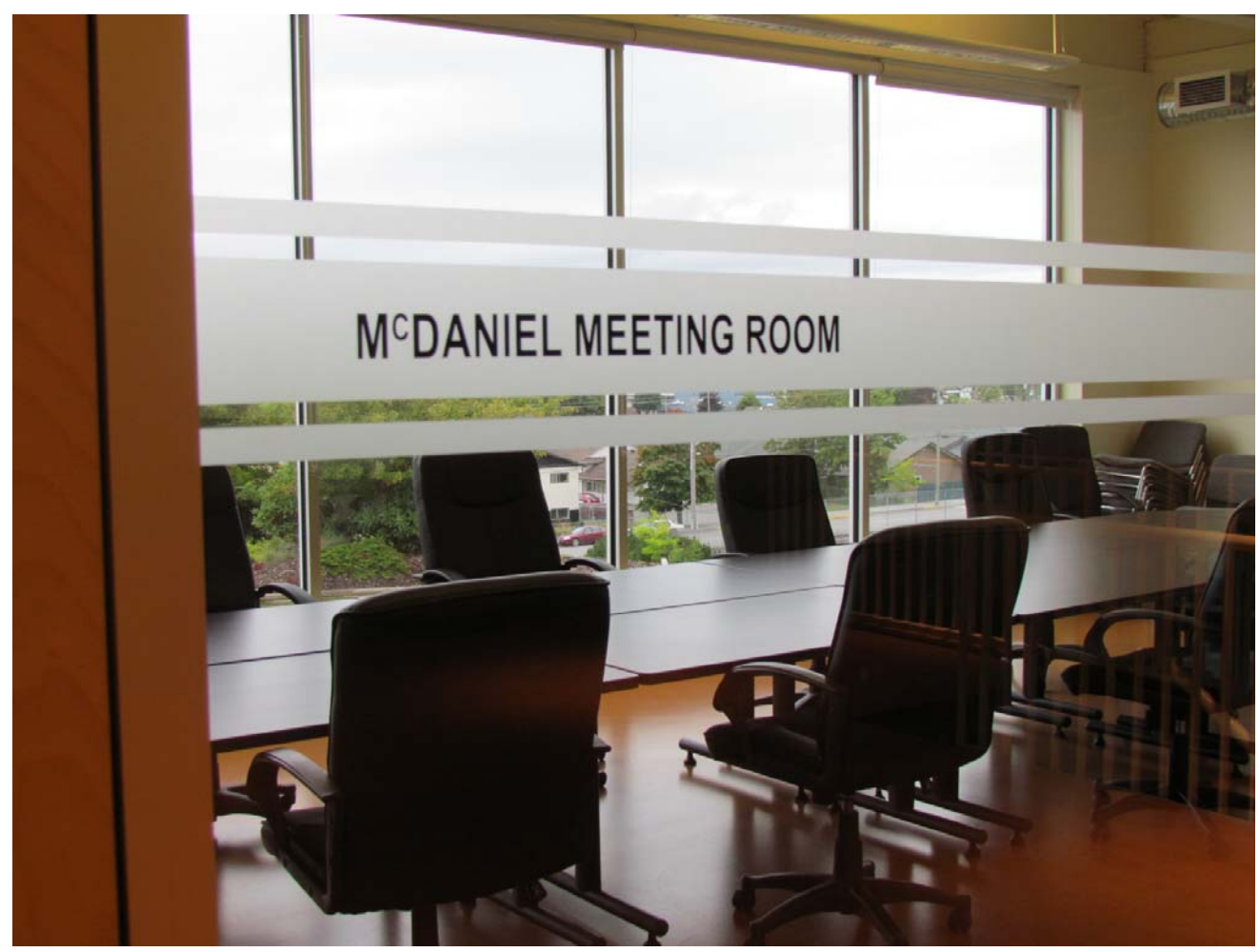
McDaniel Meeting Room at the Terrace Sportsplex

The Sportsplex granted $6500 worth of free use to rental groups who met the Waiver of Rental Fee Policy criteria. Leisure Access Passes were granted to 337 people who met the program criteria.1534 children took swimming lessons in 2012. Land fitness classes had 8835 participants. 6969 campers stayed at Ferry Island in 2012. The Main Arena ice was in for a total of 24 weeks in 2012. The Hidber Arena was in for a total of 38 weeks in 2012. When both arenas are in regular operation there is an average of 21 hours of ice utilized each day.