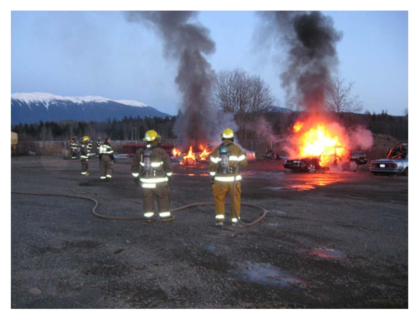
Terrace Volunteer Fire Fighters in Training