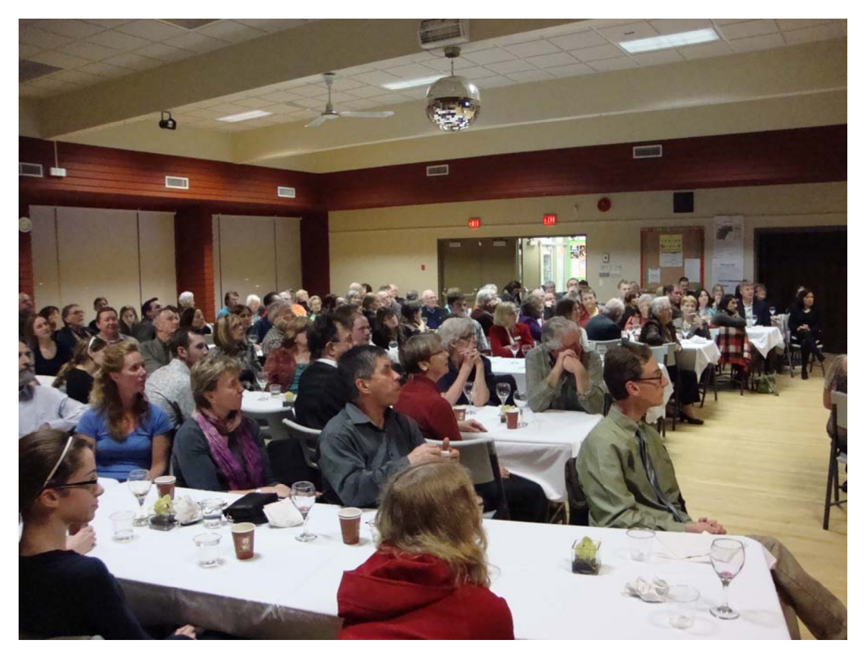
2012 Volunteer Appreciation Banquet