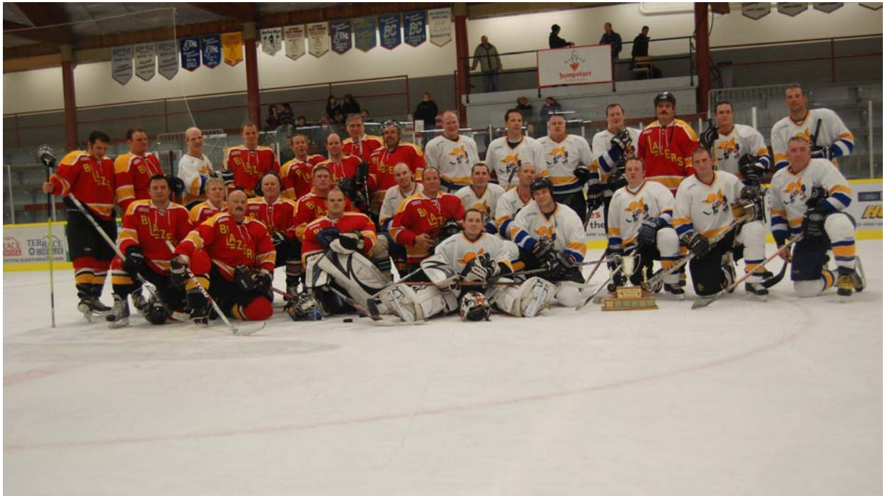
2010 Guns and Hoses Charity Hockey Game

The Terrace Detachment of the Royal Canadian Mounted Police provides front line, emergency policing services to the City of Terrace as well as the rural and unincorporated areas surrounding it. The unit is comprised of a mix of Provincially/Municipally funded front line officers and support staff. The service is an integrated and seamless one that provides a maximization of efficiency in the use of all resources in delivering policing services.