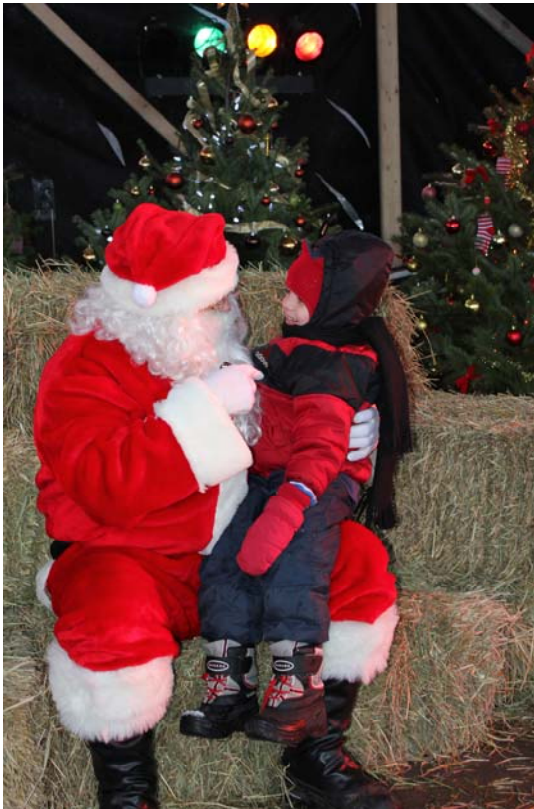
Skeena Christmas Festival