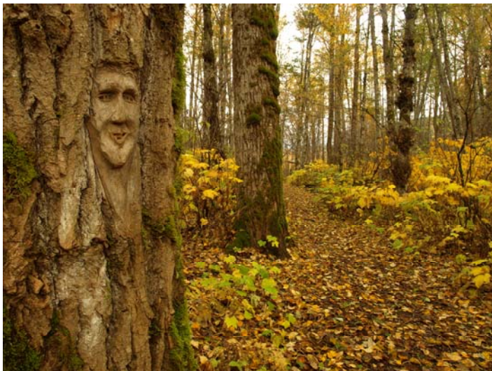
Carving at Ferry Island