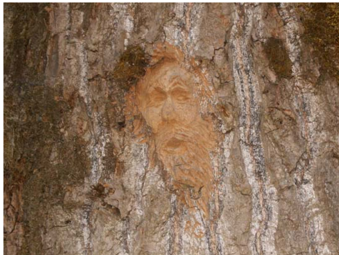
Ferry Island Bark Man

2010 was a good year for fishing and in turn this increased the amount of campers on the Island and the number of people who visited the park. A total of 16,441 were recorded to have camped on the Island in 2010. Ferry Island was also lucky to have a professional chain saw carver visit the Island and leave some of his work behind for the local hikers to enjoy.