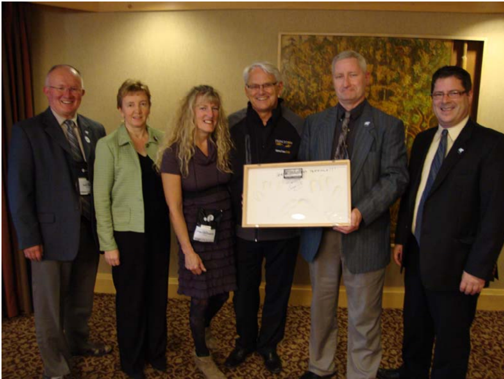
Former Premier Gordon Campbell with Mayor and Councillors at the 2010 Union of BC Municipalities Annual Convention

2% Hotel Tax Policing Costs Major Projects Commission Clean Energy Funding Opportunities for Local Governments Brownfield Remediation Food Systems Assessment/Feasibility Study for Terrace Area Funding for the High Risk Domestic Violence Committee