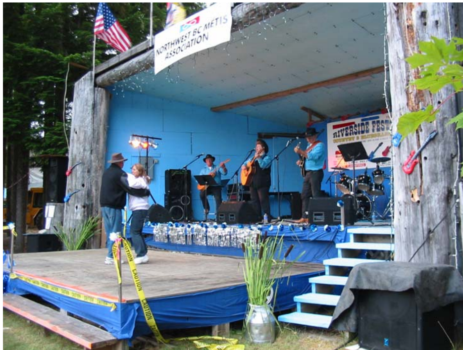
Riverside Music Festival