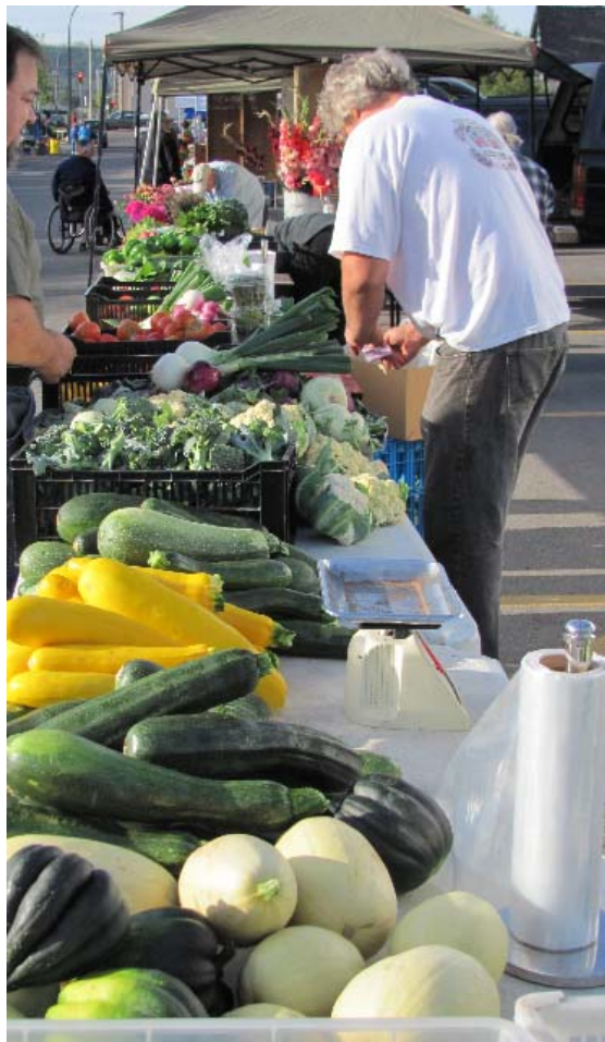
Skeena Farmers' Market