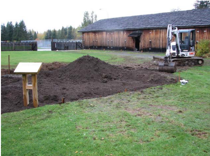
Renovation of the Heritage Park Museum garden