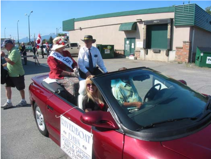
Riverboat Days 2010 Queen and Captain