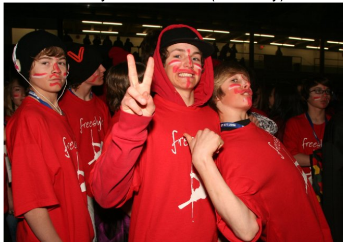
Participants of the 2010 BC Winter Games