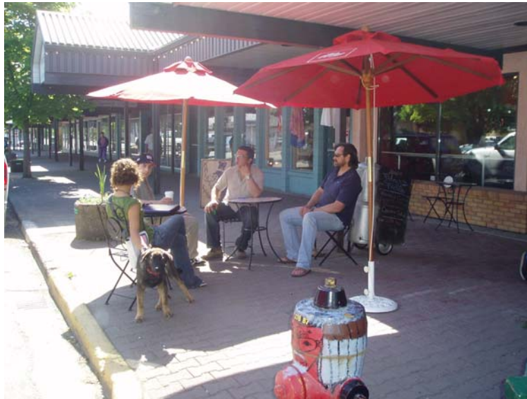
4600 Block Lakelse Avenue