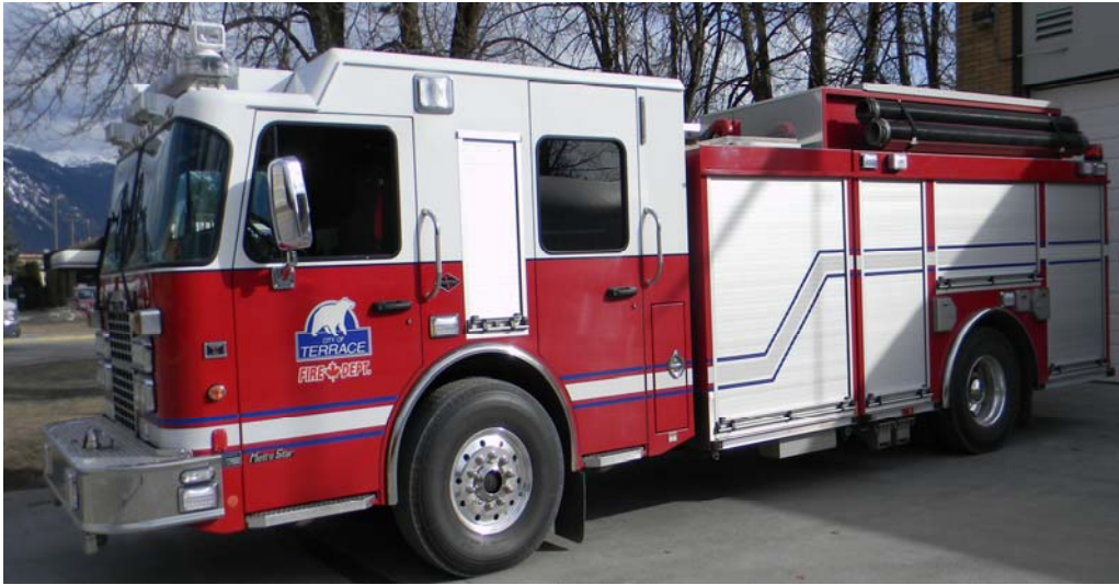
This new Spartan Metro Star Engine fire truck arrived in 2010

In 2010, the Terrace Fire Department responded to a total of 827 calls. Of these, 202 were fire-related calls (22.3 % of call volume), 544 were first responder calls (60% of call volume), and 81 were rescue calls (8.9 % of call volume).