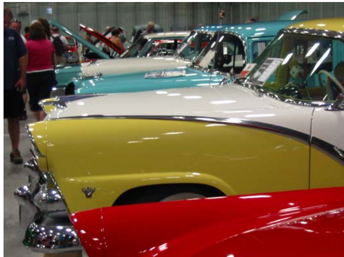
Riverboat Days Car Show