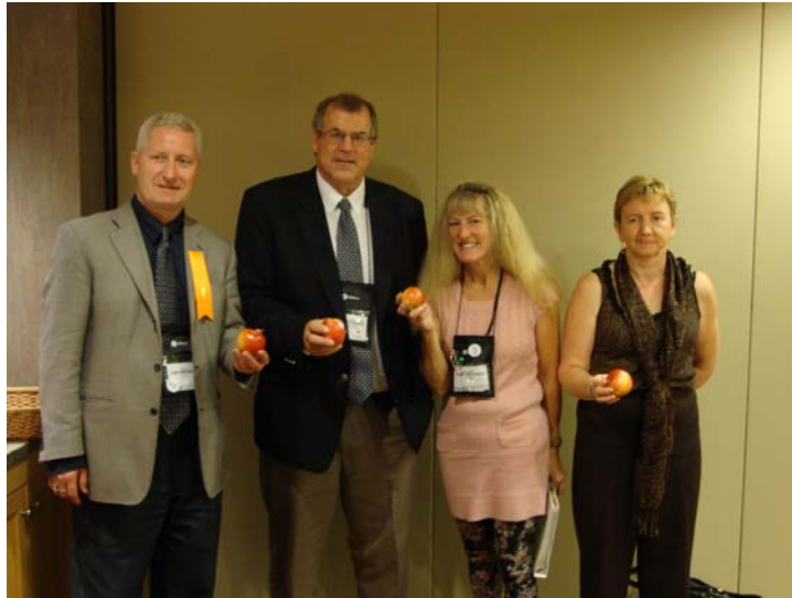
The Honourable Steve Thomson with Mayor and Councillors at the 2010 Union of BC Municipalities Convention