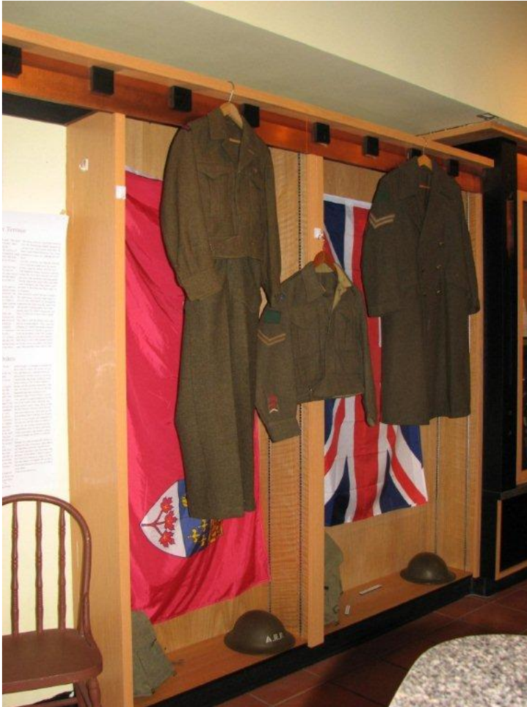
Heritage Park Museum Artifact Display