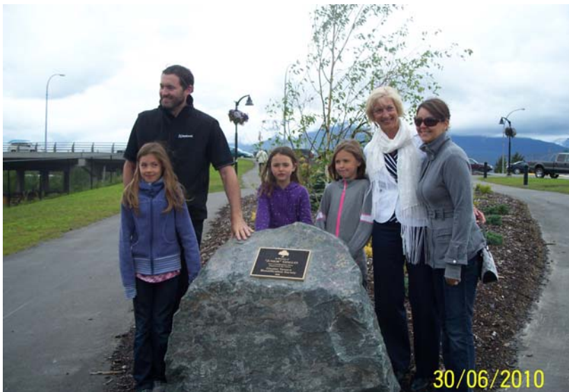
Plaque unveiling at the Grand Trunk Pathway