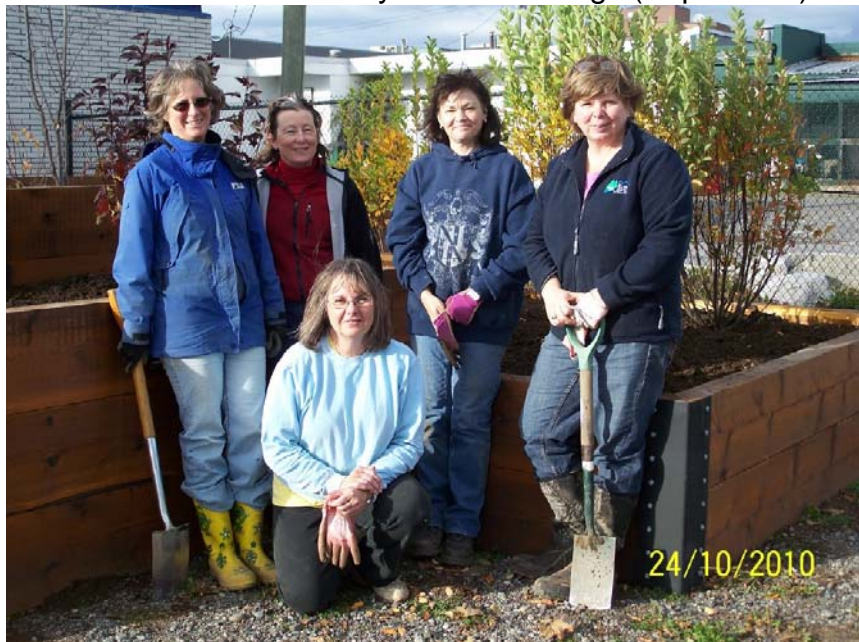
Greater Terrace Beautification Society Volunteers