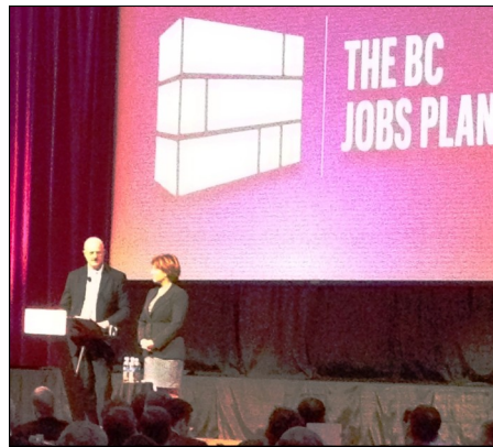
Jobs, Tourism & Innovation Minister Pat Bell speaking with Premier Christy Clark following her Keynote Address to the convention

aging to see how the provincial government understands that this is the north's decade. We will be the economic driver for the entire province for many years to come.