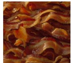
Meat, fish or bones