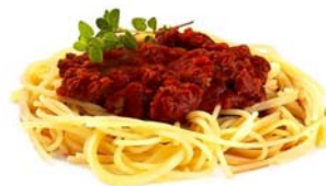
Cooked food or oil