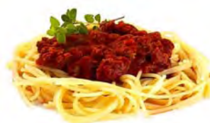
Cooked food or oil