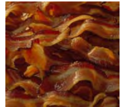
Meat, fish or bones